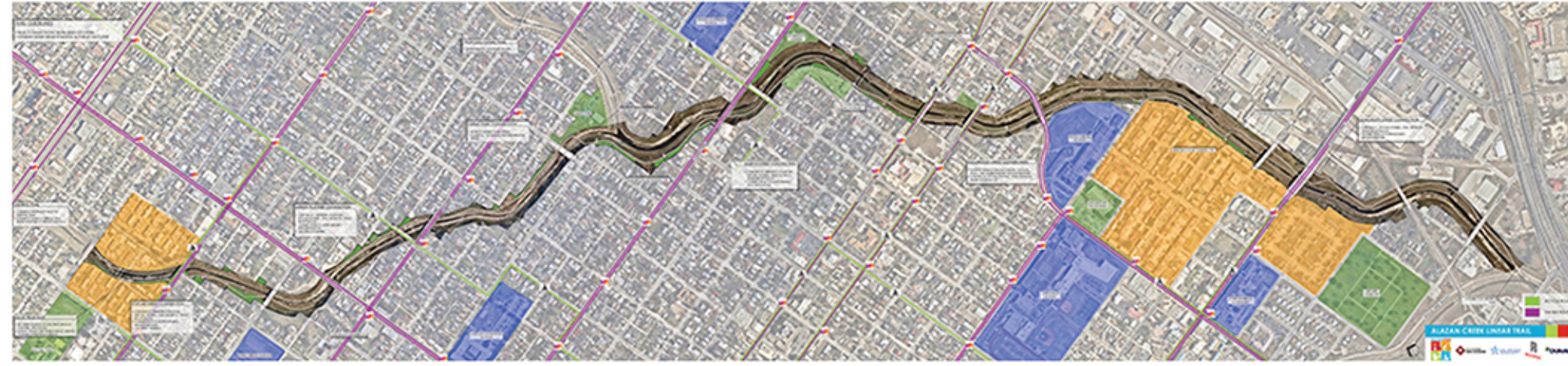
Alazan Creek Trail Site Plan Schematic

Their most recent project is the 3 mile long hiking and biking Alazan Creek Trail for the San Antonio River Authority and the City of San Antonio in which RESPEC is the lead design team.